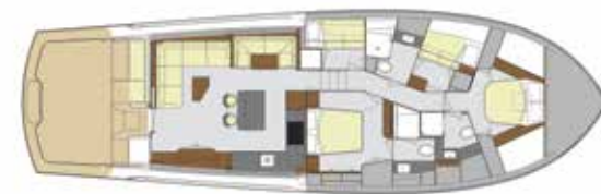
STANDARD 4-STATEROOM/3-HEAD ARRANGEMENT