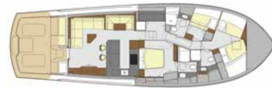
OPTIONAL GALLEY, TACKLE ROOM AND BOW STATEROOM ARRANGEMENT